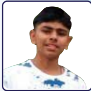
Om Kodre 94.00%